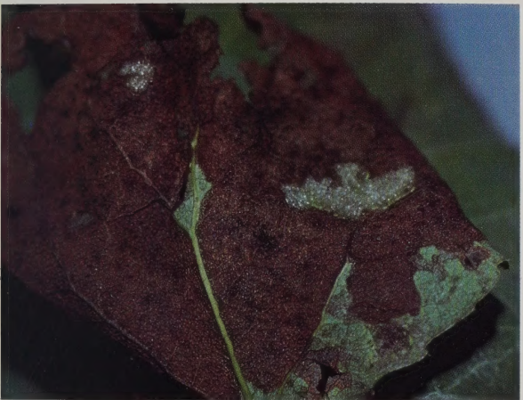
Figure 4. Tortrix egg masses. Note leaf skeletonization as a result of feeding by young larvae.

Eggs hatch by the end of July, and the young caterpillars are active until mid-August. Within each rolled leaf, tortrix feed on the lower and upper surfaces. Only a skeleton of the leaf is left. A new generation of caterpillars migrates to protected areas, spins shelters, and overwinters to begin the cycle once again (Figures 4-6).